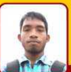
Ujjal RRB JE KOLKATA