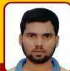
Valbhav RRB JE PATNA