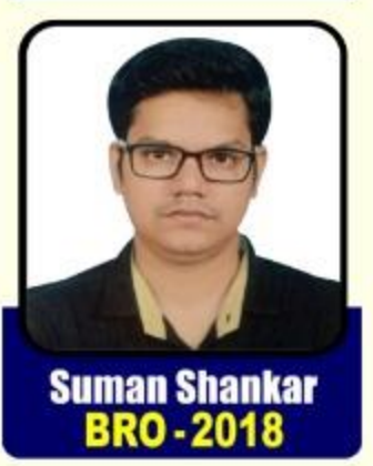
Many More ....